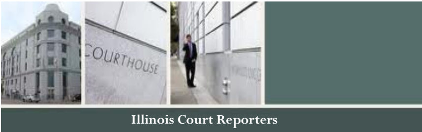
Illinois Court Reporters

Starting salary range for an Official Court Reporter is $37,440 to $42,440, except for Cook County which is $47,942 to $52,942, plus transcript fees. Additional salary for realtime certification.