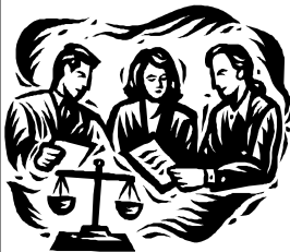
Hobart Kiwanis Board Members →